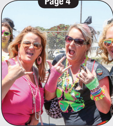
Like Totally festival in Huntington Beach canceled by organizers