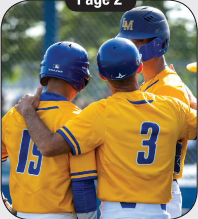
La Mirada-Mira Costa playoff baseball game postponed due to weather