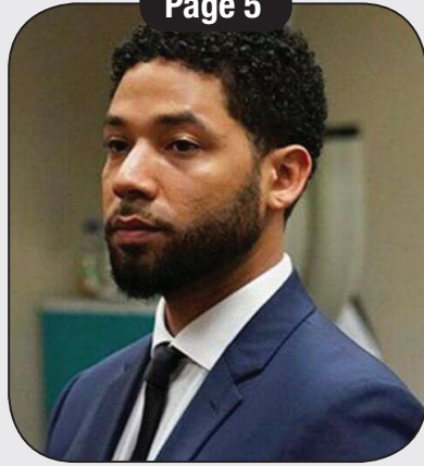
'Empire' to end after Season 6 with 'no plans' to bring Jussie Smollett back