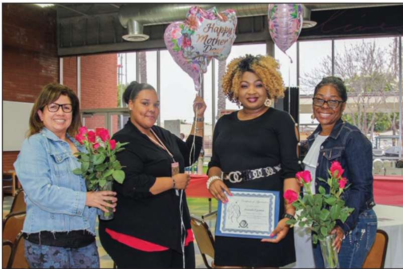
Hawthorne Chamber of Commerce and South Bay Workforce Investment Board recognize award winning mothers with gift certificates donated by the Hawthorne Chamber of Commerce for Mother's Day, Thursday, May 09, 2019 at the Hawthorne Teen Center