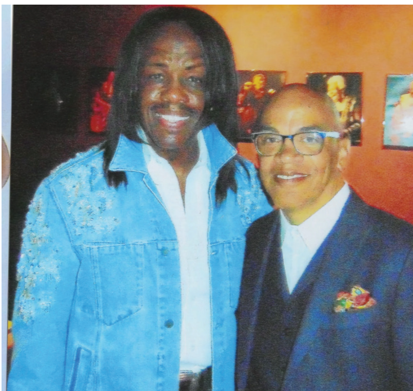
Verdine White (Earth Wind and Fire), and Rickey Minor-(Music Director) share a moment at the FPCAC-Gala

Some " Friends" in attendance like Jackson Brown sang two of his big