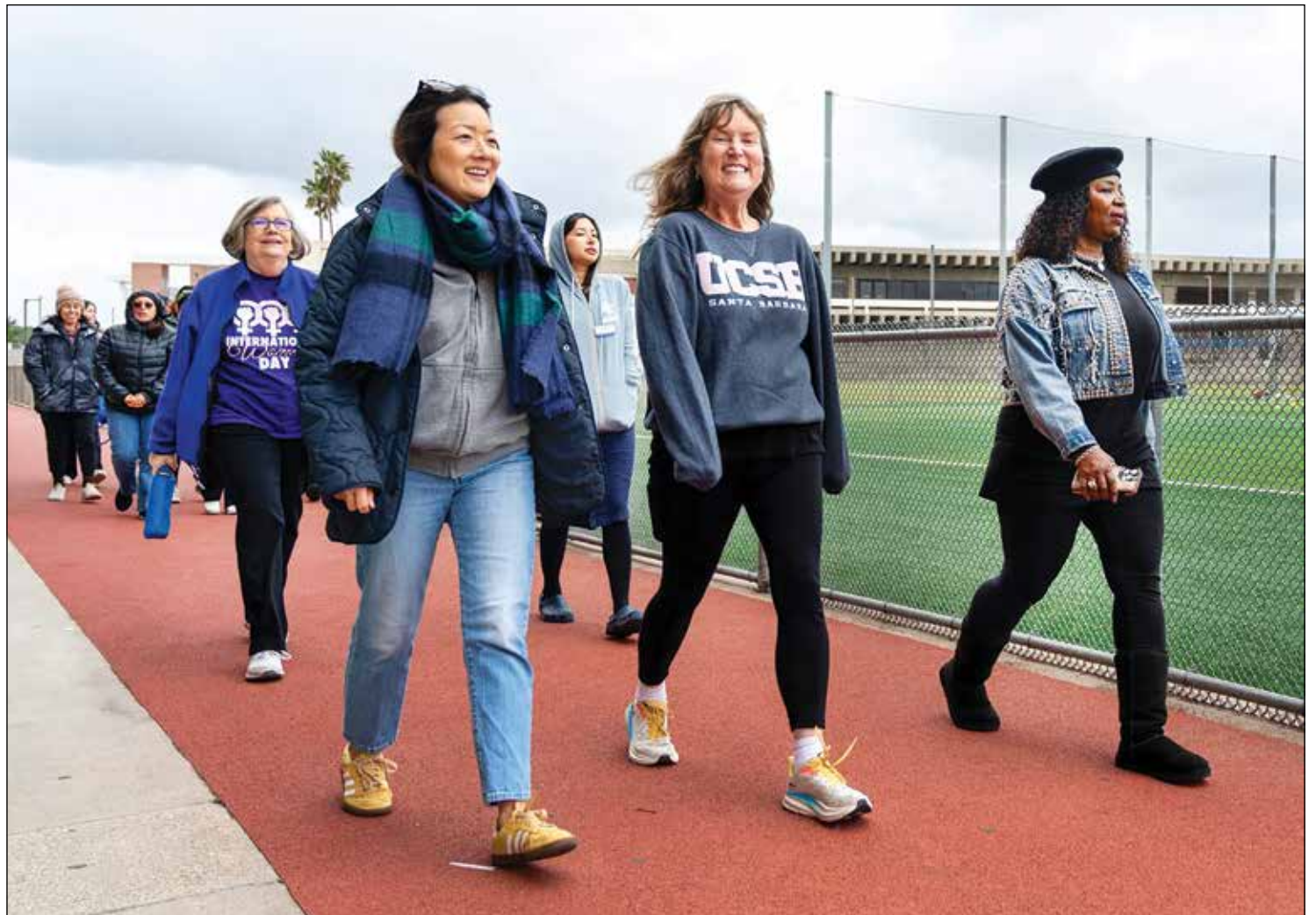
Rain and wind couldn't stop the El Camino College's annual Women's Walk. ECC is celebrating Women's History Month with a lineup of guest speakers all leading up to our annual Distinguished Women's Awards and Reception. To view the full event lineup for Women's History Month, please visit www.elcamino.edu/whm .