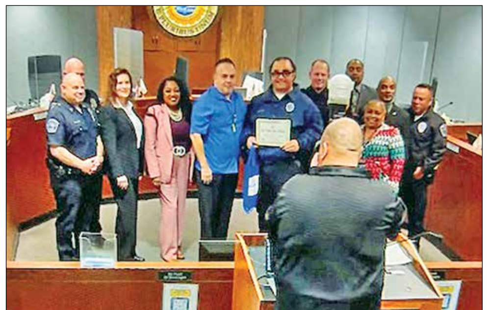
Good Neighbor Award.